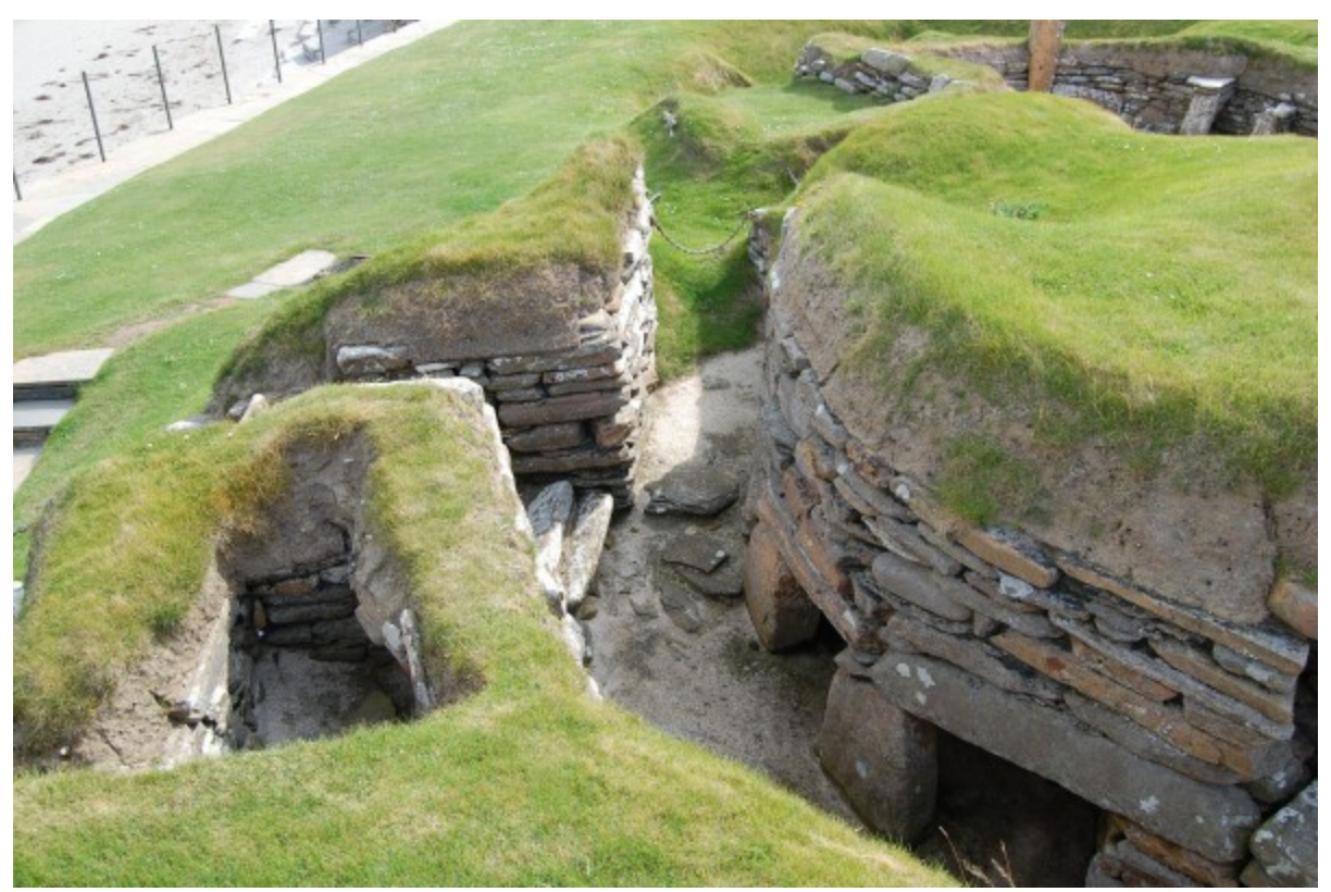
Archaeologists estimate that 50-100 people lived in the village. When the settlement was built, the houses were 1,500 meters from the sea. Now, the sea has dug closer to the village and the view from the settlement has changed from pastures to the sea.