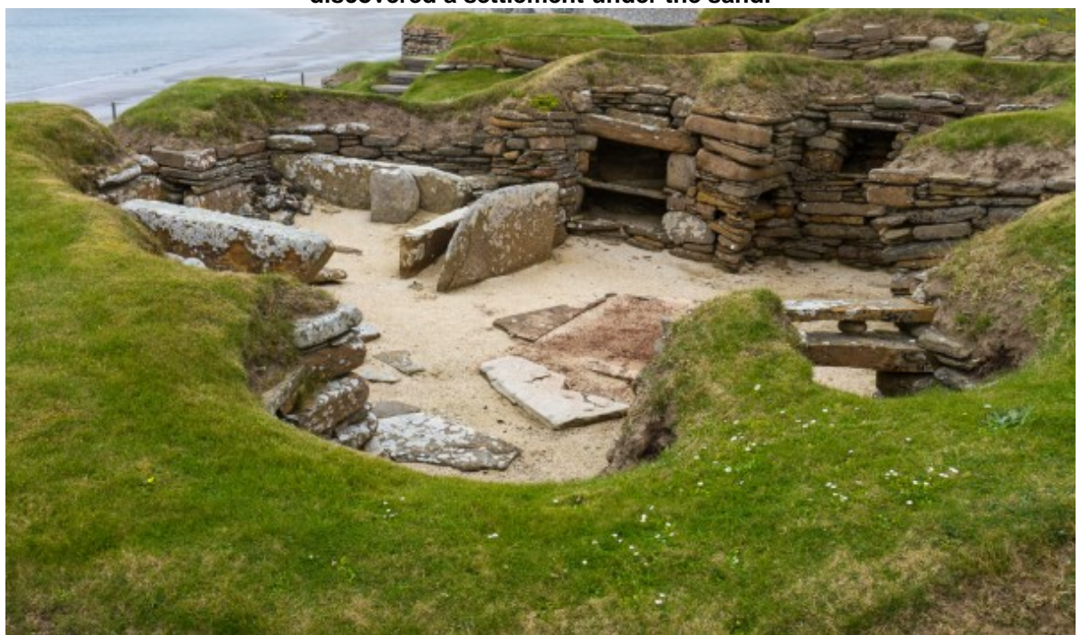
The settlement consists of eight stone houses and was inhabited between roughly 3180 and 2500 B.C., making Skara Brae one of the oldest agriculture villages in the UK.

The winter of 1850 hit Orkney hard. A severe storm caused great devastation and resulted in more than 200 deaths. But it also revealed something long forgotten. When the storm abated, villagers discovered a settlement under the sand.