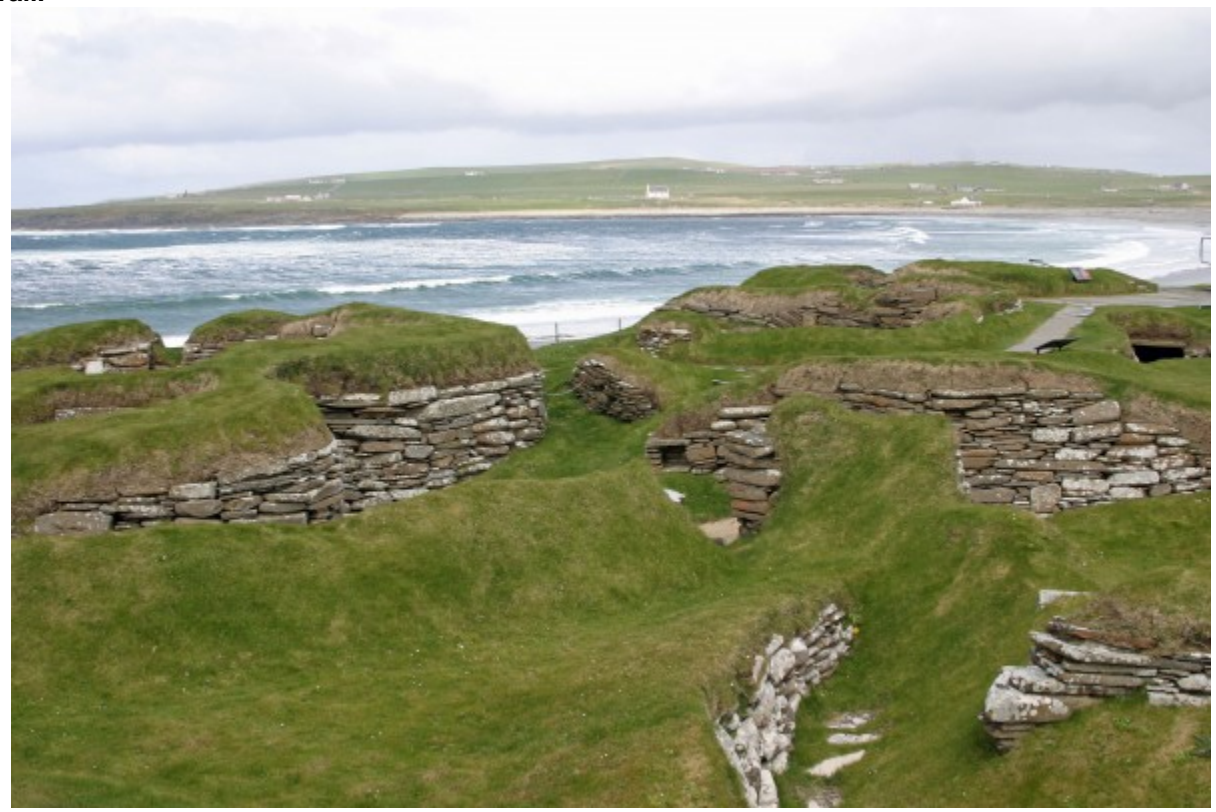
There has been talk about building an artificial beach with boulders and breakwater to preserve Skara Brae and several other ancient monuments at risk of being destroyed. But nothing has happened yet. Until further notice, tourists continue to visit this fascinating place, but the question is for how long?

Whats the future look like for Skara Brae? Although the settlement was built nearly two kilometers from the beach, in recent centuries, it has been increasingly threatened by the sea. Since 1926, the houses have been protected from the approaching sea and harsh autumn winds by a concrete wall.