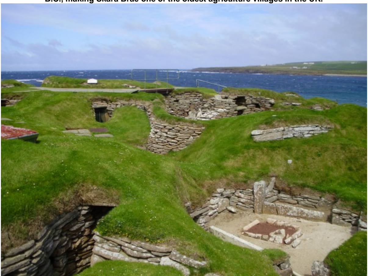
Skara Brae has been called the Scottish Pompeii because the ancient monument is so well preserved. Since the surrounding sand and the buildings architecture were well protected against the cold, both the buildings and their contents have been remarkably preserved throughout the millennia.