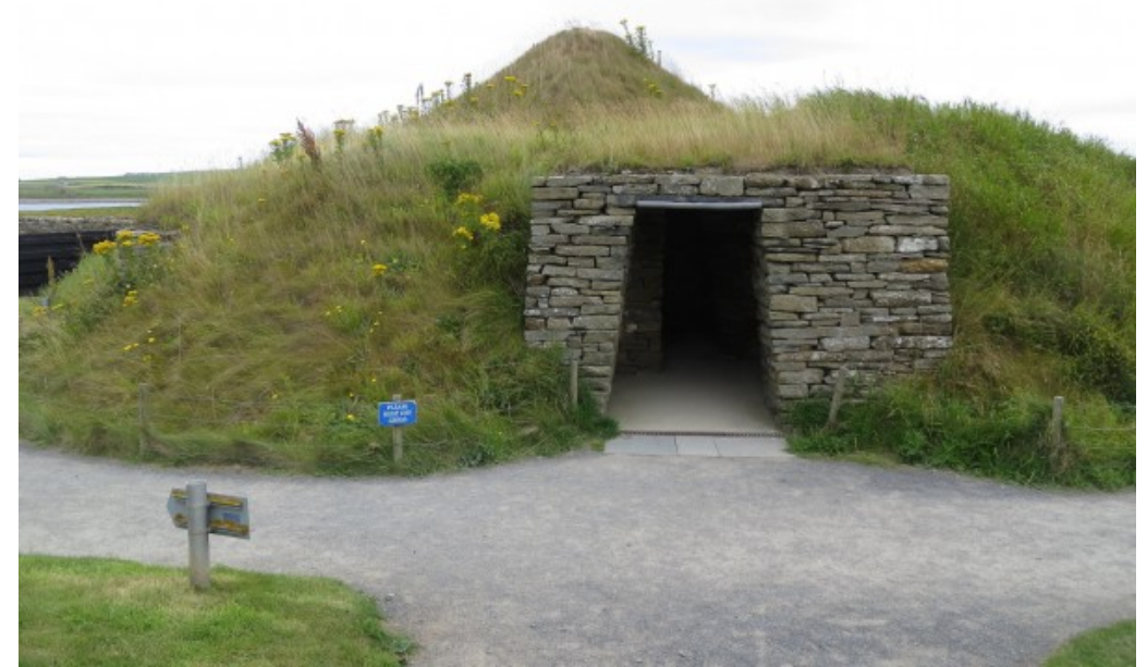
At first, it might not look like much, but the fact is, this is a unique and magical place.

Nestled in the mossy, green hills on the Orkney Islands off Scotland is a secret older than the great pyramids of Egypt.