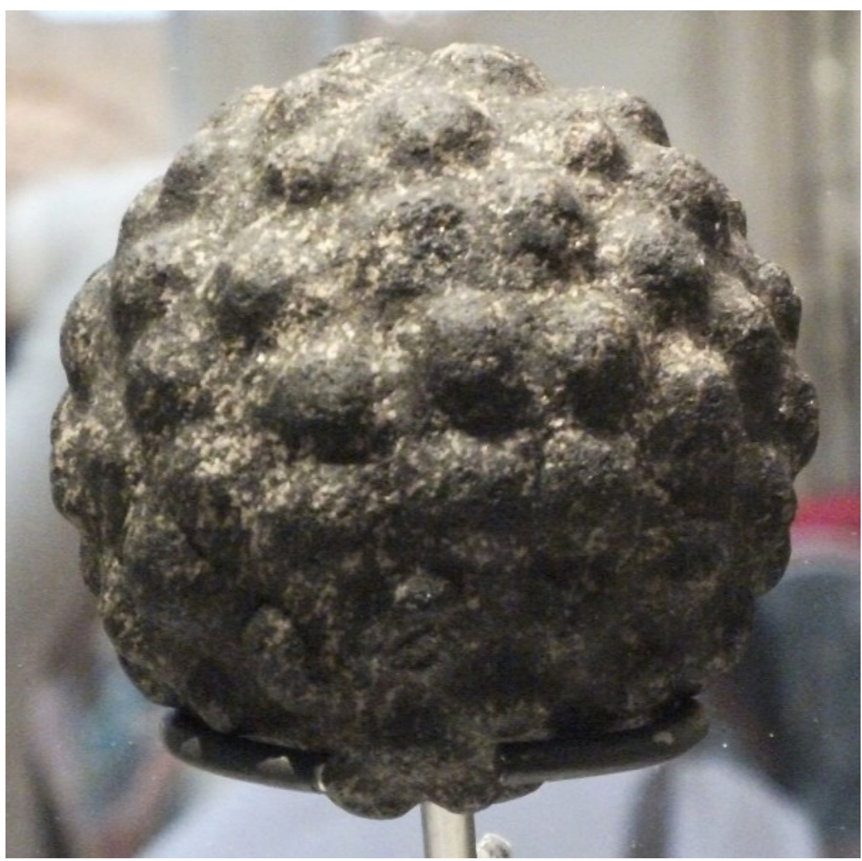
And no one knows why the village was abandoned. But around 2500 B.C., the Orkney Islands became cooler and wetter. Many theories speculate about how the people of Skara Brae met their fate; the most popular ones involve a violent storm.