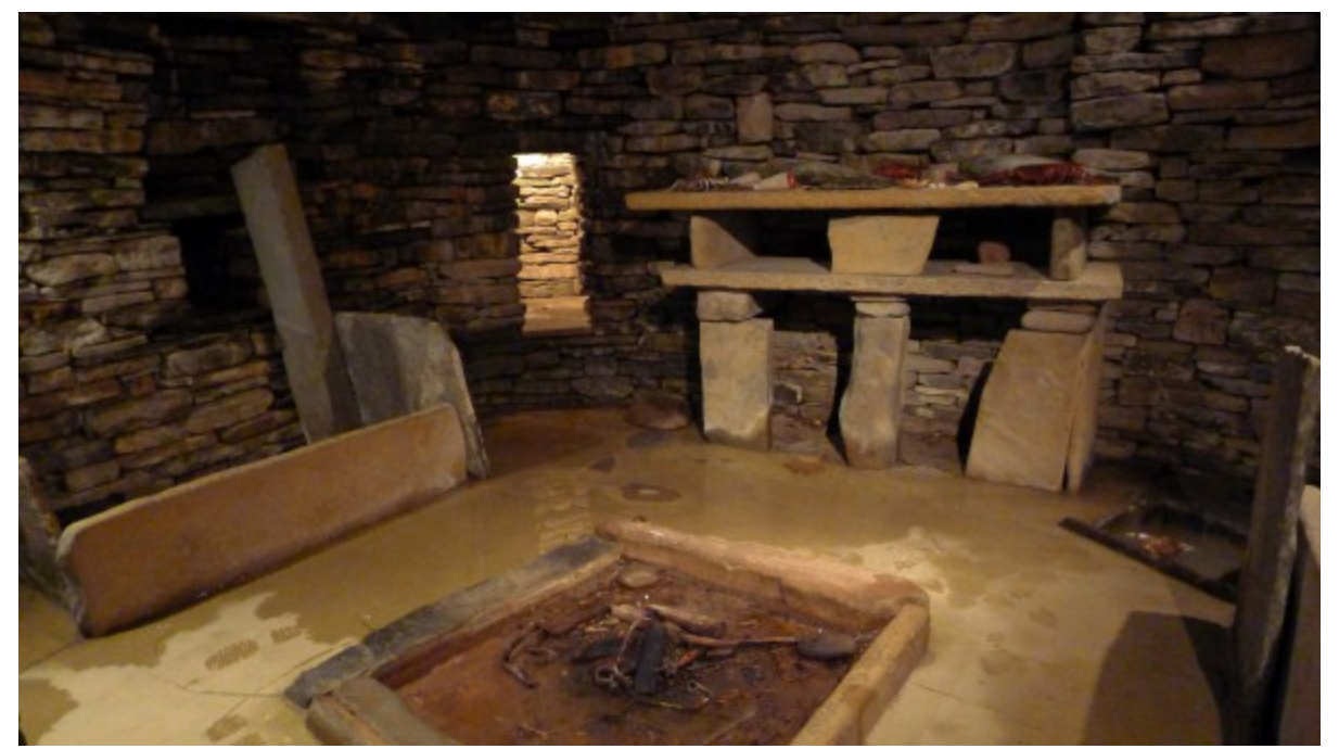
One house is distinct from the other, however. Archaeologists didn't find any beds or other furniture. The house is believed to have functioned as a workshop.

Amazingly, the village also had a sewage system and each house had its own toilet.