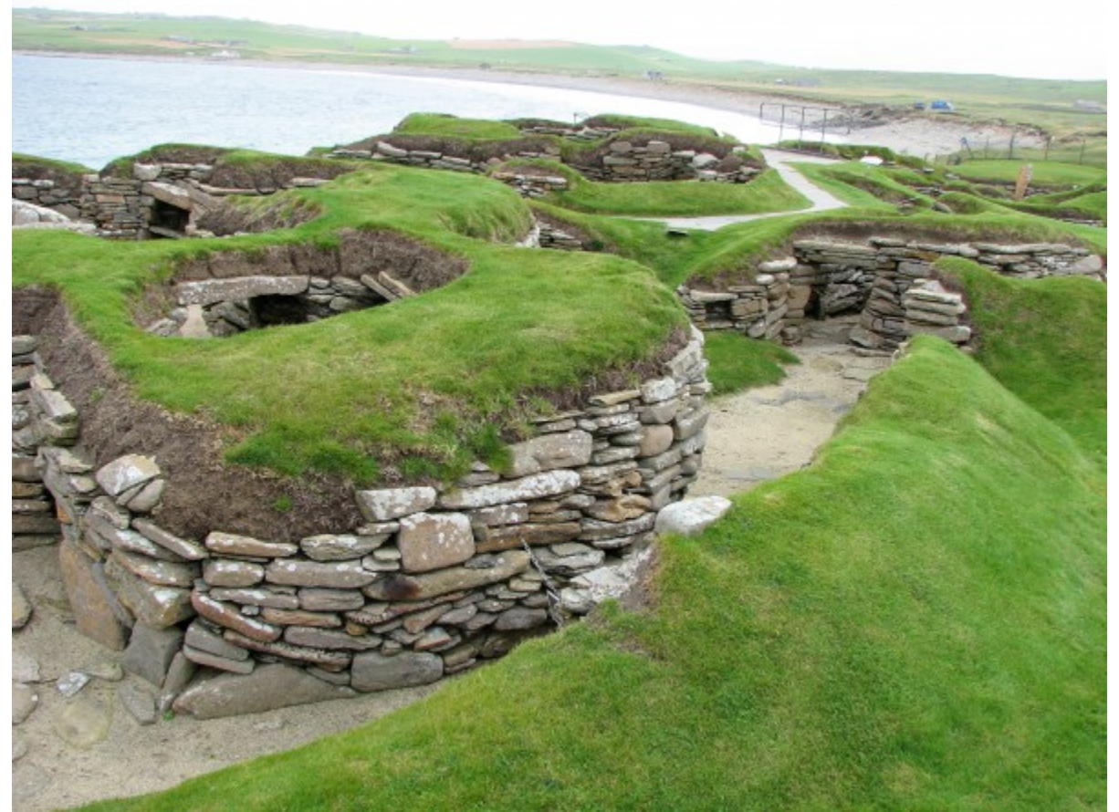
The settlements seven or eight houses were connected to each other by tunnels. Each residence could be closed off with a stone door.