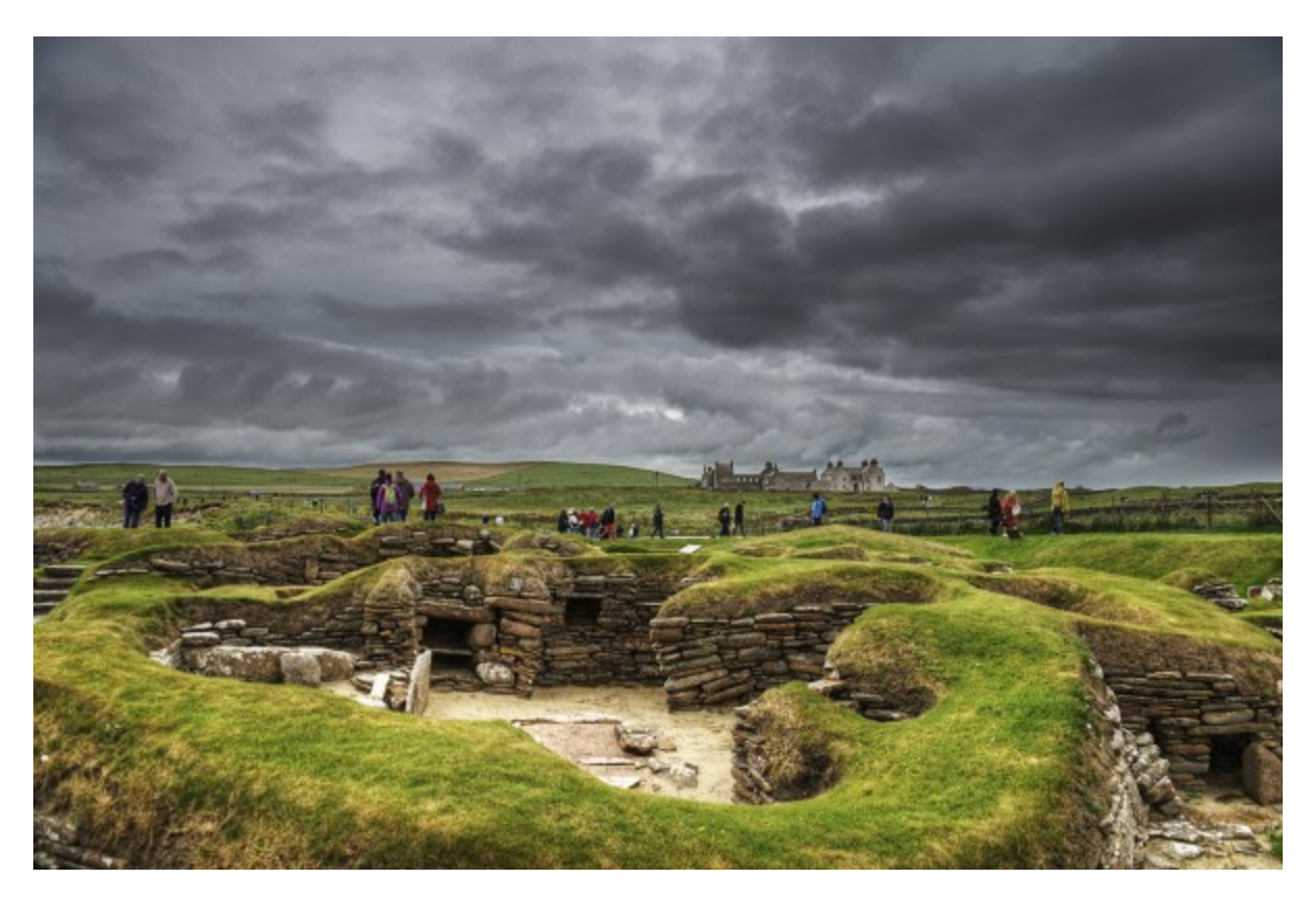
I personally hope that the Scottish Government will do all they can to preserve this amazing place.